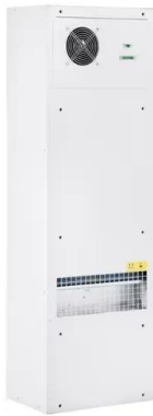
50KW modular power converter

This landmark project will redefine the value and status of electrochemical energy storage solutions in the global energy landscape.