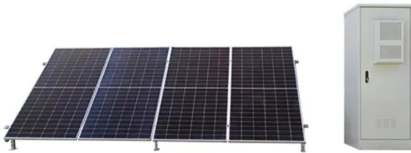
Image analysis of flow battery energy storage system