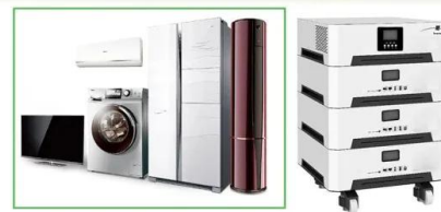
50KW modular power converter